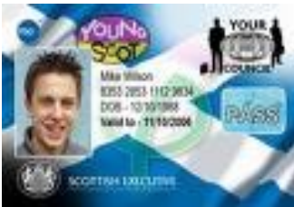
YOUNG SCOT CARD