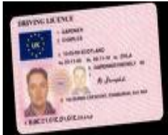
EU PHOTO DRIVER'S LICENCE