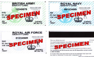
MILITARY ID CARD