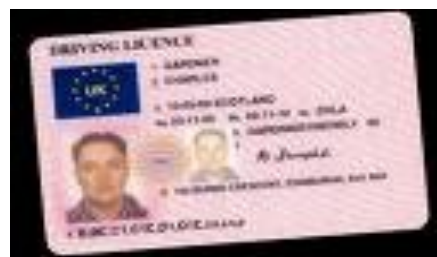
EU ID CARD