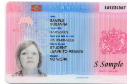
BIOMETRIC IMMIGRATION CARD